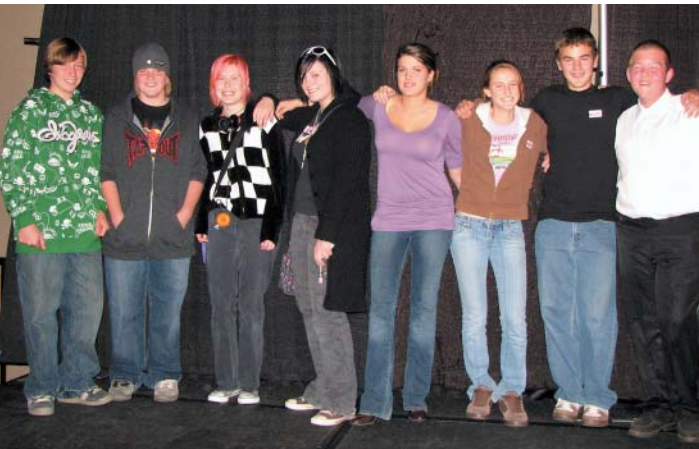
SFL campers attending annual convention

Please contact the SFL Ready for Work Coordinator to arrange a presentation.